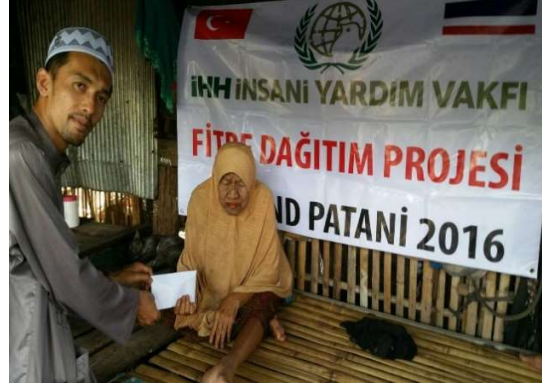
Figure 4 IHH South Asia Desk Coordinator, Thailand, email, 2022