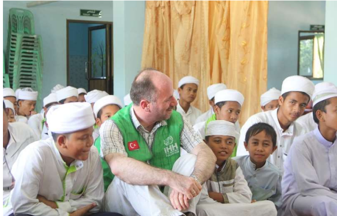
Figure 5 IHH South Asia Desk Coordinator, Thailand, email, 2022

The figures below show the number of orphans who have benefitted from periodical assistance in Thailand until now.