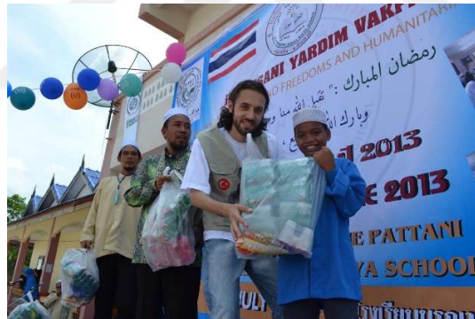
Figure 3 IHH South Asia Desk Coordinator, Thailand, email, 2022