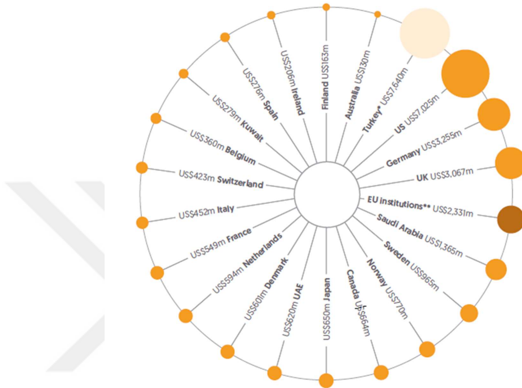
Figure 2 20 contributors of the largest amounts of international humanitarian assistance. “International humanitarian assistance.” Global Humanitarian Assistance Report 2020 , p.35

global private sector funding to international humanitarian assistance is estimated to have grown by 3% amounting to $192 million. 78